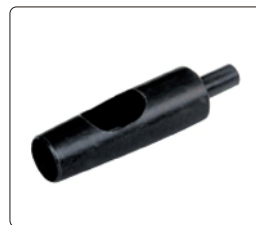
sample cutter (included)