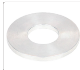
metal pad (included)