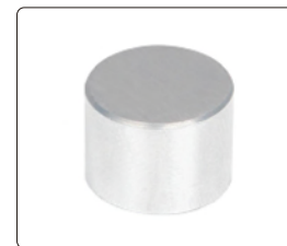
grinding block (included)