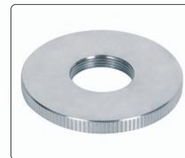
weight (2.5N) (included)